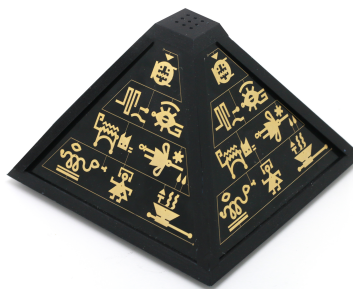
Figure 1: An early prototype of the grain prism instrument.

The Grain Prism is inspired by these two movements. It allows the player to record and manipulate audio samples, and seed a digital granular synthesis patch. The pyra-