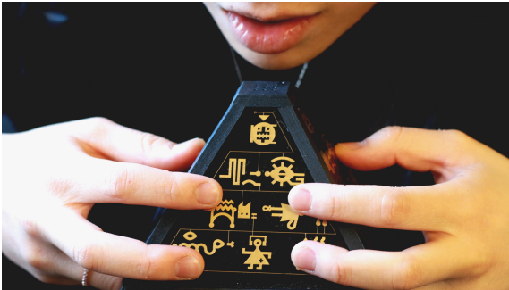
Figure 3: Interacting with the Grain Prism

The Prism uses the advantage that symbols have over words in triggering imagination. Incorporating a culturally mysterious alphabet as a reference point in the design, in combination with electronic schematics symbols, it offers a medium for storytelling through touch. Since there's no obvious design guidelines in the interface that resembles typical audio samplers/recorders, users will tend to create their own "mental mapping" of how the instrument works. The pyramidal geometry of the instrument hints out on some of its primitives. The audio gets recorded through the top of the pyramid and the sound is played through a speaker on its bottom. The Grain Prism enclosure is composed of 4 triangular PCBs joined by 3D printed parts. Each PCB has exposed copper drawings that work as capacitive touch points acting as digital buttons wired to a Teensy microcontroller and processed through Teensy's built in capacitive touch capabilities. Sounds are recorded from an electret microphone located at the very top of the instrument, whereas the bottom, includes an amplified speaker powered by a 5V lithium ion battery. The shape drives the player, who instinctively holds the instrument with both hands and touches a single or multiple glyphs to achieve sonic behaviors.