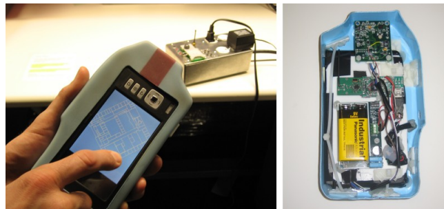
Figure 1: This Tricorder, inspired by Star Trek , uses a 3-axis compass to maintain the displayed map of our lab at a fixed orientation relative to the actual lab, allowing for a pointing interface to real-time, situated sensor data provided by the Plug sensor network nodes, an example of which is in the background (left). The opened backside of the Tricorder device shows the battery pack, radio, compass, Nokia 770, and glue logic used to connect the radio to the Nokia via USB and compass to the radio via USART (right).

network, a 3-axis compass with electronic gimbaling to ascertain absolute orientation in three dimensions with up to \pm 80^\circ tilt [11], a battery pack power supply, and a plastic case to hold it all together. See Figure 1. Like the fictional Tricorder, our version knows in which direction it is pointing thanks to the compass. This, combined with coarse localization based on the radio's received signal strength indication (RSSI) from nearby embedded sensor nodes, allows for real-time point-and-browse functionality while physically roaming within the sensor network itself.