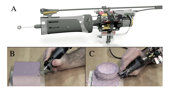
Figure 1: (A) The FreeD and (B-C) the process of making a bowl from polyethylene foam.

The FreeD is a freehand digitally controlled milling device (Figure 1). With the FreeD we harness CAD abilities in 3D design while keeping the user involved in the milling process. A computer monitors this 3D location-aware tool while preserving the maker's gestural freedom. The computer intervenes only when the milling bit approaches the 3D model. In such a case, it will either slow down the spindle, or draw back the shaft; the rest of the time it allows the user to freely shape the work. Our hope is to substantiate the importance of engaging in a discourse that posits a new hybrid territory for investigation and discovery - a territory of artifacts produced by both machine and man.