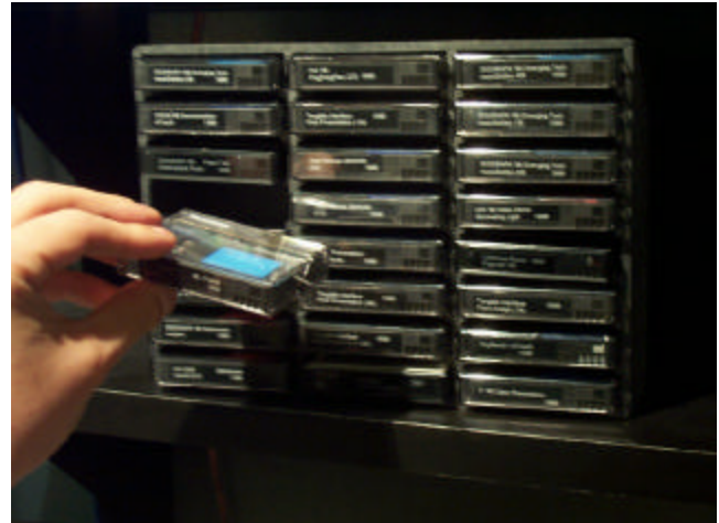
Figure 1. Existing storage system for a collection of mini DV tapes.

A collection management system assumes the user has some knowledge of how to operate it. For any given system, a balance must be struck between how much information on how to use the system is embedded within the system itself and how much is the user required to know beforehand. For example, there is a much steeper