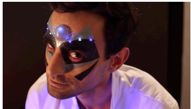
Figure 2. Carnival Mask

We developed two prototypes to apply our wearability factors in different design goals. Carnival Masks are face decorations that generate interactive lighting patterns. The devices are big (3cm diameter) and self-contained with all the electronics inside. SkinSense is a digital tattoo with capacitive touch sensing and embedded LEDs. The on-skin part of SkinSense is soft and thin, because its rigid electronic parts, including microcontroller board