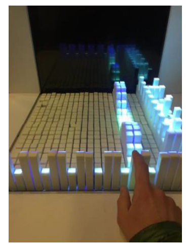
b) A user triggers a sound wave while drum beats also play.